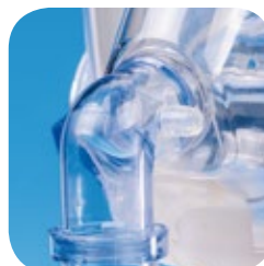
Non-Vented "SE" elbow for dual limb ventilators