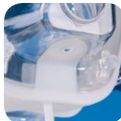
Dedicated airtight NG tube port