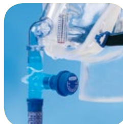
Easy Vent Kit