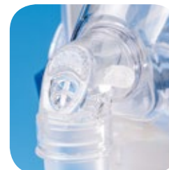
Non-Vented elbow with safety valve